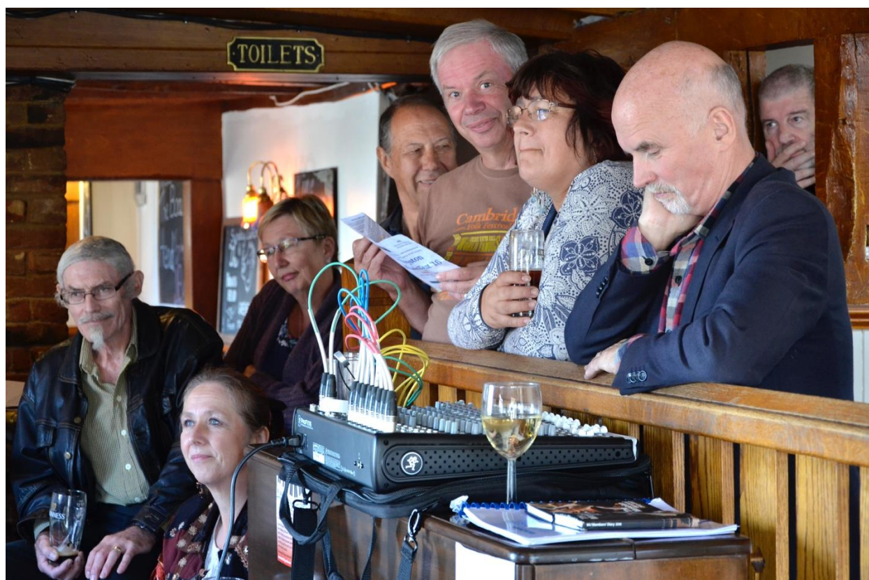
Onlookers at MusicFest'16