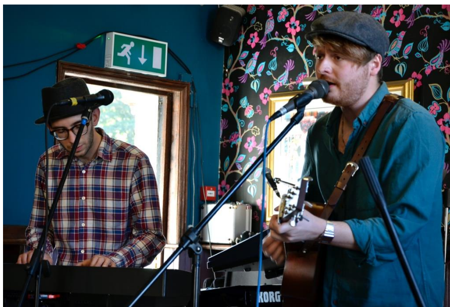
Dusty Wagons at MusicFest'16