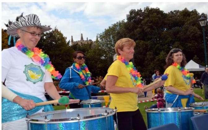
Garden City Samba at Community Arts Event